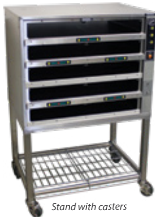
Stand with casters