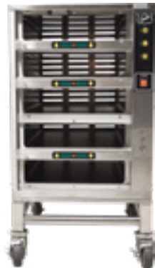
Stand with casters